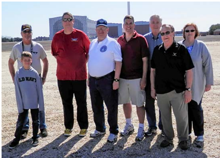
Liberty Chapter members at NAS Lakehurst