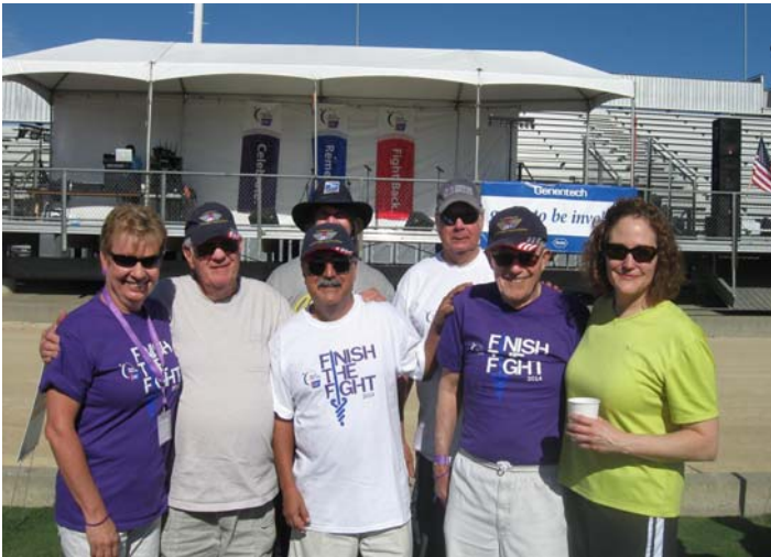
Parker-Aguillon-Payne Chapter members-American Cancer Society Relay for Life