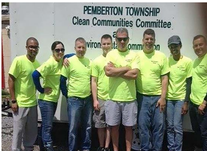
Liberty Chapter members - Pemberton Township Clean Communities Day 2014

We held a fundraiser at the 2014 JB MDL NJ Open House 10-11 May. The USAF Thunderbirds were the main attraction. We had 8 members man a food booth for the weekend. The weather cooperated except for a shower on Saturday afternoon. We are still waiting to find out how much money we raised. We have done this fundraiser before and have always done well.