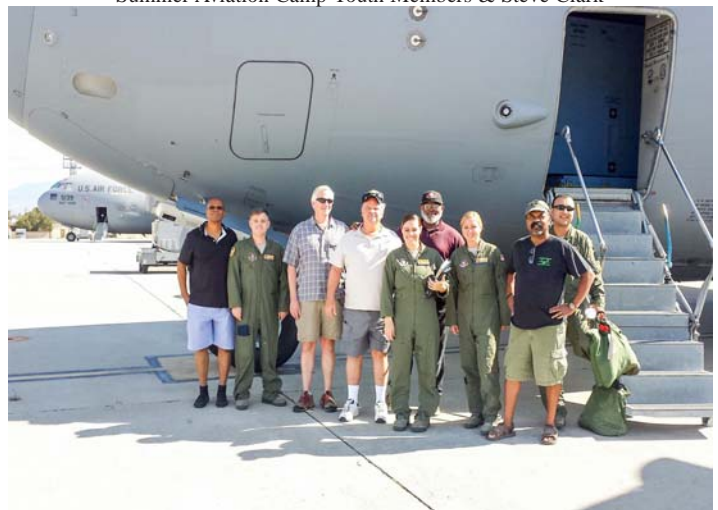
Golden West Chapter Visit To 729th Airlift Squadron