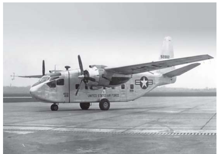
Chase C-122 Avitric