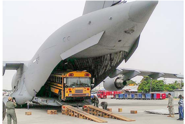
732d AS Loadmasters offloading a school bus in Haiti as part of the Denton cargo program. The program delivers donated humanitarian cargo to countries in need.