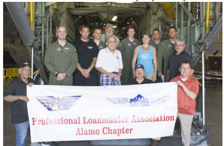
Alamo Chapter/Basic Loadmaster Course Fundraiser