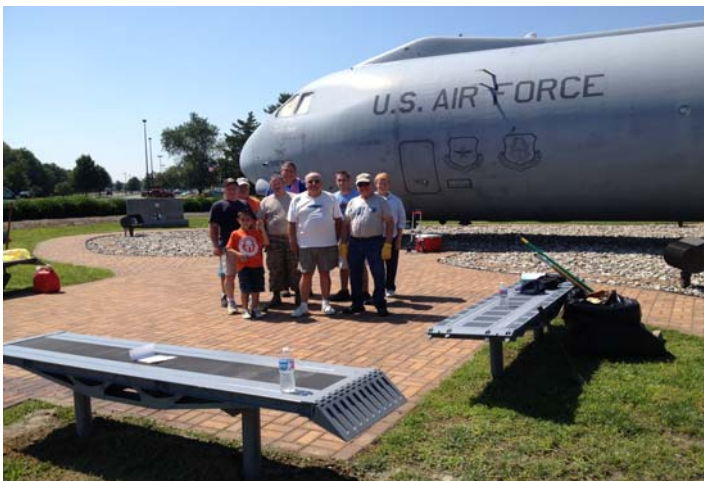
C-141B Starlifter memorial on McGuire