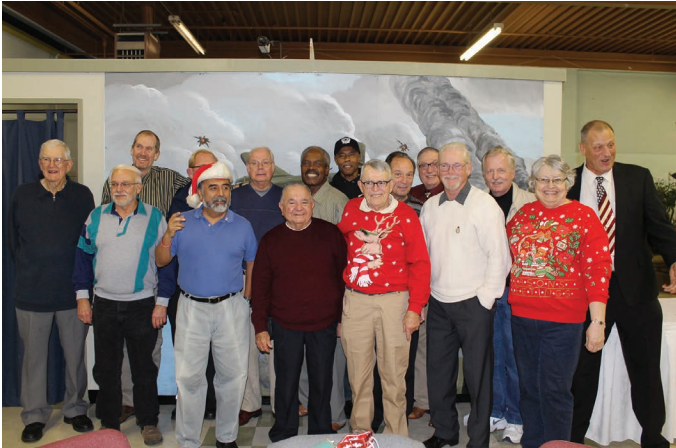
P-A-P Chapter members at the 2014 Christmas Party