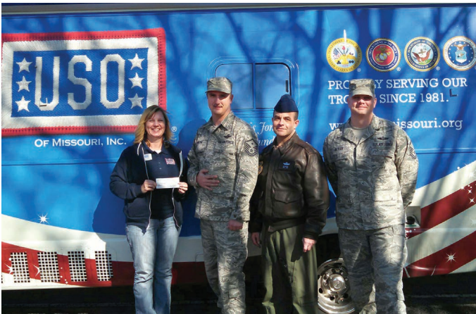
Gateway Chapter members donate to USO