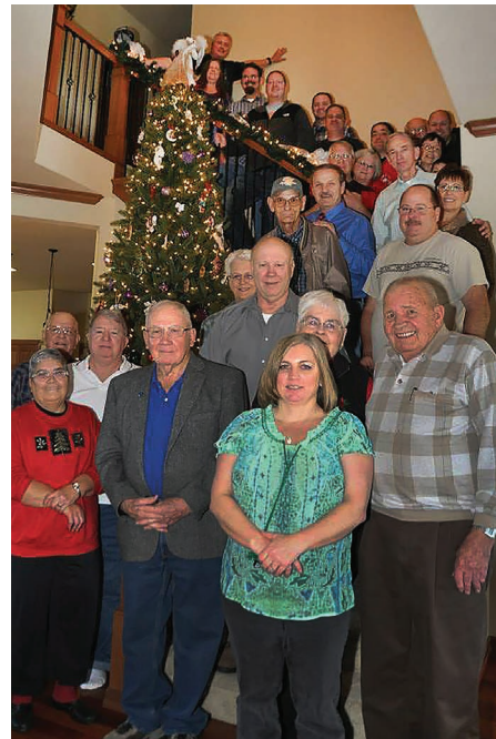
Northwest Chapter 2014 Christmas Party