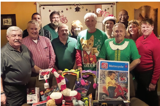
Liberty Chapter members at 2014 holiday party