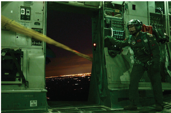
Altus AFB C-17's airdropped personnel from the Texas Army National Guard, 1st Battalion, 143rd Infantry Regiment. See the video at: https://www.youtube.com/watch?v=H2TSOhbW21w&list=PLBV-tF3X5uF1W0sPWcl530vVEpu-cU-V