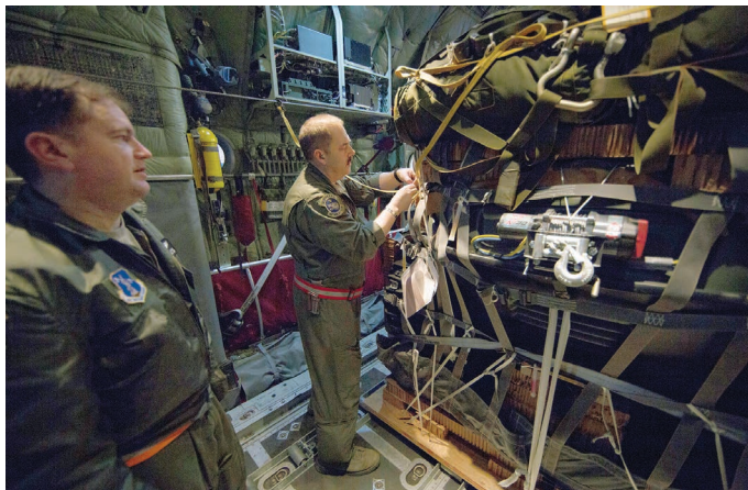
Alaska ANG takes part in arctic mobility exercise, Loadmasters from the 144th AS rig a palletized arctic sustainment package in a C-130 during Excercise Spartan Pegasus