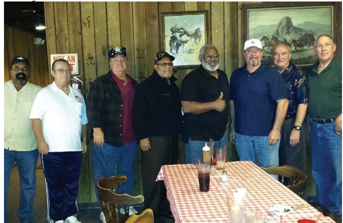
Golden West Chapter members at 2014 Christmas luncheon