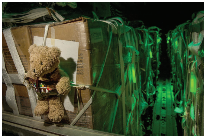
A teddy bear donated by an American child remains tied to a C-130 Hercules assigned to the 746th Expeditionary Airlift Squadron, prior to take-off during a humanitarian airdrop over Iraq, Aug. 14, 2014, at a base in the U.S. Central Command area of responsibility. The humanitarian aid includes bottled water and food which was delivered to displaced citizens in the vicinity of Sinjar, Iraq. The teddy bear was donated to pass along gratitude to children trapped in the Iraq conflict.