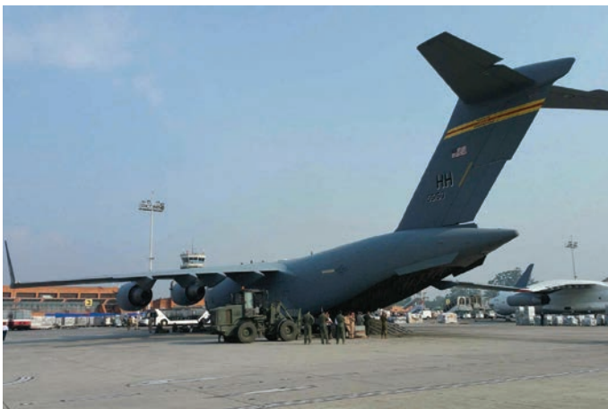
Hickam C-17 supports humanitarian aid mission to Nepal