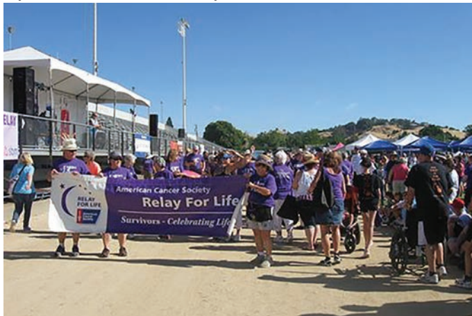
American Cancer Society, Relay for Life, in Vacaville, California