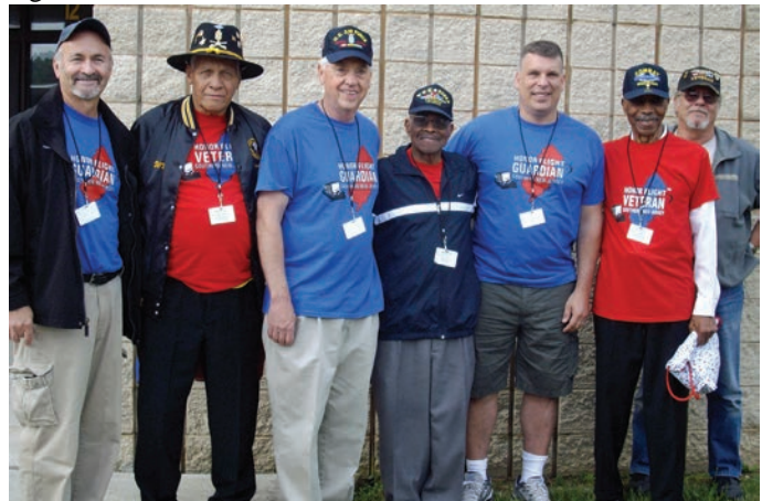
Liberty Chapter members at the New Jersey Honor Flight event