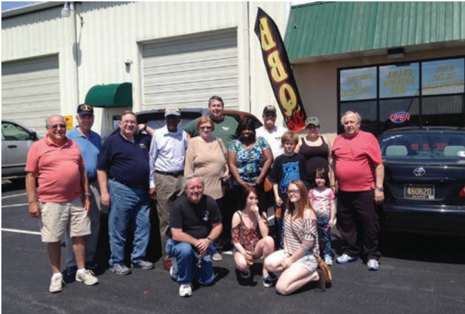
Liberty Chapter members on trip to AMC museum at Dover AFB