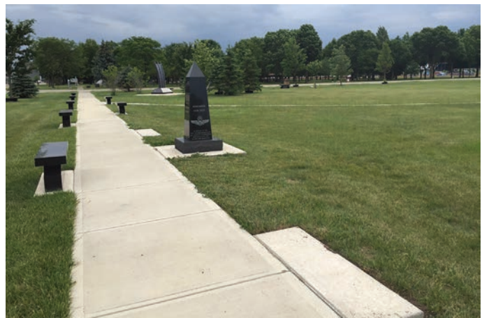
New cement pads on each side of the PLA monument at the National Museum of the U. S. Air Force