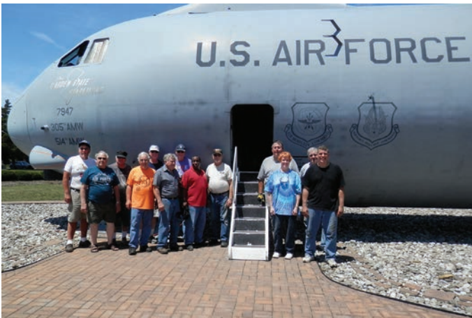
Liberty Chapter members at C-141 Memorial clean up