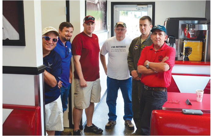
The Rock Chapter members during chapter meeting on June 21, 2016

when we look for nominations for a new governing board. If you have any questions, please give me a call. My number is (501) 606-3133 or email me at calcaterra76@gmail.com . Load Clear