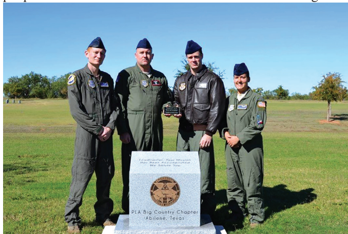
Big Country Chapter members in front of the monument representing the PLA at the VA cemetery