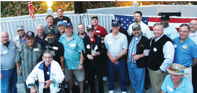
March 5, 2016 Norton AFB Loadmasters the "Stars Return to Norton" reunion