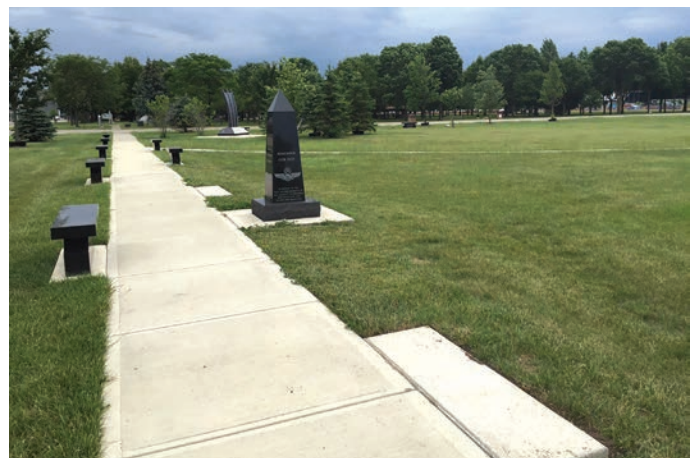
New cement pads on each side of the PLA monument at the National Museum of the U. S. Air Force. The Bill Cannon bench will be placed on one of these pads