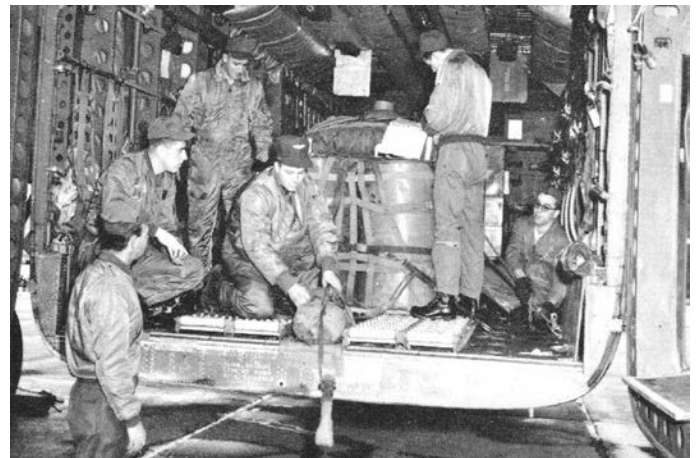
Yours truly, fourth from the left. Good view of the shot bag and parachutes. Notice the winter flying suits. It was pretty nippy in the back of that thing in winter with the doors off.

it yet) you put the 3-foot pilot chute and then connect one end of its lanyard to the shot bag fitting. Slide one end of the long safety cable under the A-22 and insert the end through the bag closing grommet on the pilot chute, safety tie it with good old Ticket 5 cotton thread and you're ready for the Before Starting Engines Checklist. The observant among you will have figured out that only one end of the pilot chute is hooked to anything. More on that later. So, the way all this works is that at Green Light, the copilot pulls the Glider release lever, the Pilot pitches up smartly, the shot bag falls off pulling the pilot chute out with it. The pilot chute opens and pulls out the extraction chute (I know, it's not connected to it but it will be), the extraction chute opens and pulls on the four knives in sequence, cutting the release gate (Left, Right, Top, Center), thereby allowing the A-22 to roll out of the airplane. And, if you've followed your After Loading Checklist and hooked up the static line to the anchor cable, the G-12 will open and down it goes.