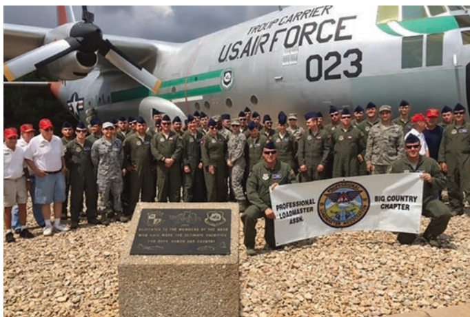
Big Country Chapter membership drive and fellowship meeting

Chapter will have a float in the upcoming Veteran's Day Parade November 12, 2016. The Big Country Chapter will be starting up an Active Duty Auxiliary to the Big Country Chapter that will meet every 3rd Thursday of the month starting in November. The meeting will be primarily professional development and Loadmaster specific training. The main chapter meets every other month at the VFW Post 6873 (Please see the Facebook page for actual dates and upcoming events).