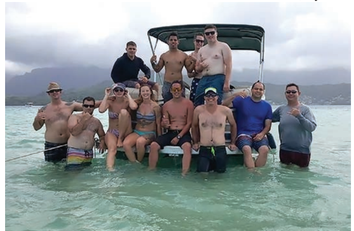
Aloha Chapter members at Kaneohe Bay Pontoon "Pau Hana" morale event