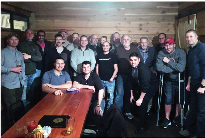
Gateway Chapter Winter Social

force in mind, as they uphold the Global Mobility mission. As each house of cards fall, they are working miracles to ensure the pain is minimized even if they min-turn you in Hickam. After a long week of pushing missions at TACC, pushing policy at A-Staff or pushing a walker in retirement the Loadmasters of the Gateway chapter enjoy any chance they can to get out and break bread with fellow loadmasters and their families. We recently had that opportunity on February 10, 2017 when we held our annual Gateway Chapter Winter Social. This year's event was held at the Main Street Brewing Company and Loadmasters of all generations and airframes were in attendance. Of course, there were plenty of stories told, some taller than others. The next event on the horizon is our Loadmaster Family Float Trip to Lesterville, MO on the Black River and it will occur Saturday July 29, 2017. If it is anything like our Winter Social it will leave us with memories to share with the best friends ever, LOADMASTERS!