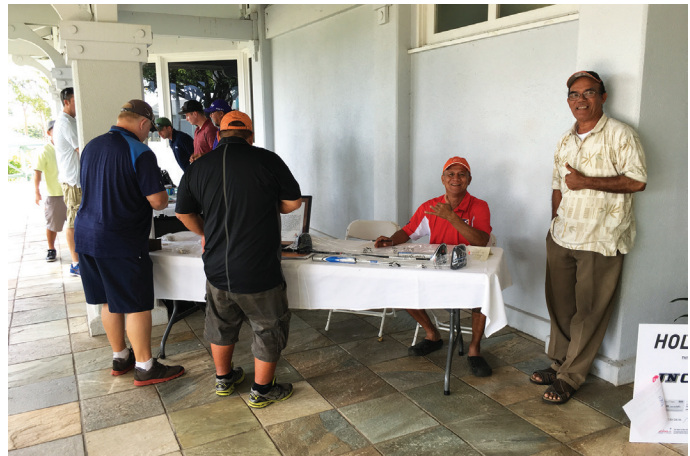
Aloha Chapter Golf Tournament